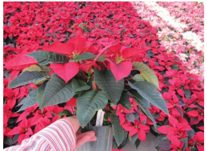
Christmas Day (SK 64) - mid season variety (November 25 - Dec 2, 8-8.5 weeks), medium-high vigor, and sturdy.

The next category growers are asking for is the "Prestige" category. A high vigor variety with extremely sturdy stems, nice V-shaped habit, and late mid-season finishing. Christmas Day (SK 64) fits this bill. Its advantages over Prestige™ Red are that it shows more color on top earlier and