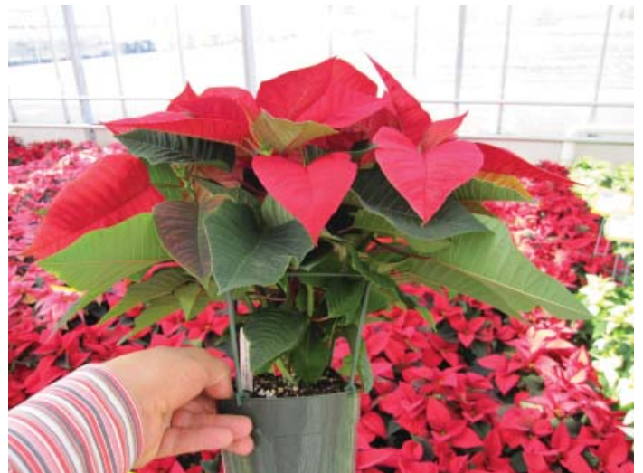
Noel (SK 67) - mid-season variety (November 20-27, 8 weeks), medium vigor, upright habit, and sturdy.