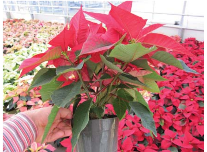
Happy Christmas (SK 70) - early season variety (November 15-22, 7.5 weeks), medium vigor, and sturdy.