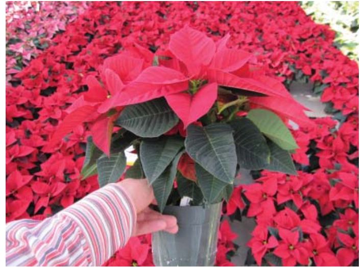
Christmas Eve - early season variety (November 15-22, 7-7.5 weeks), medium vigor, upright, and sturdy.