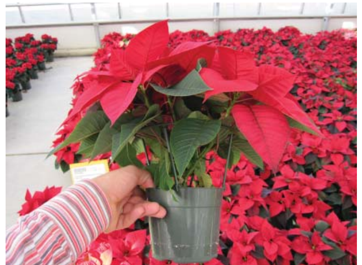
Christmas Beauty (SK 62) - mid-season variety (November 20-27, 8-8.5 weeks), low vigor, upright, and very sturdy.