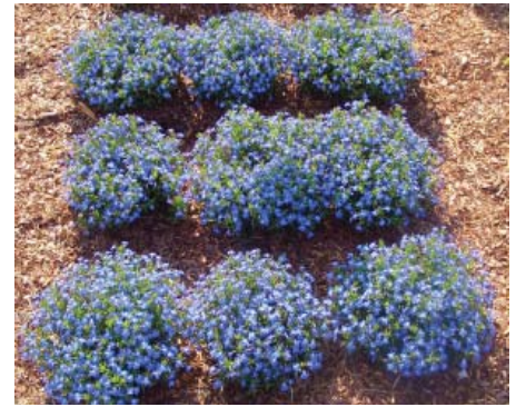
Magadi™ Blue at the 2006 UOF trial. A real Heat-lover!