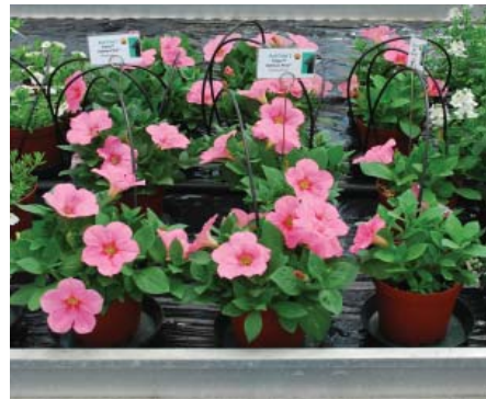
MiniFamous™ Perfect White (left) and Fame™ Salmon Pink (right) in our soil trial. The grower mix is to the right (small plants).

the root systems revealed it all. The plants in the grower mix had a weak root system. The trial showed clearly how important a good soil mix is.