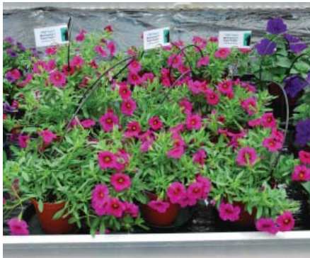
MiniFamous™ Super Purple is a vigorous variety.

and flowers are pushed on top of the plant, resulting in a colorful display. The best version for small pots was #3 with the early Sumagic drench. In this case the drench is applied about 2 weeks after pinching or when the new branches are about 1-inch long. The trial included also Petunia, Verbena, and Osteospermum. Our PGR recommendations and more technical details can be found in the back of our catalog.