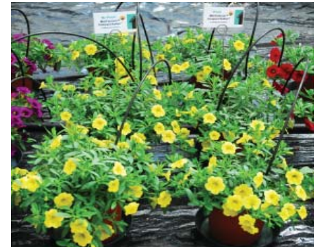
MiniFamous™ Compact Safran No-pinch (left) versus pinch (right).