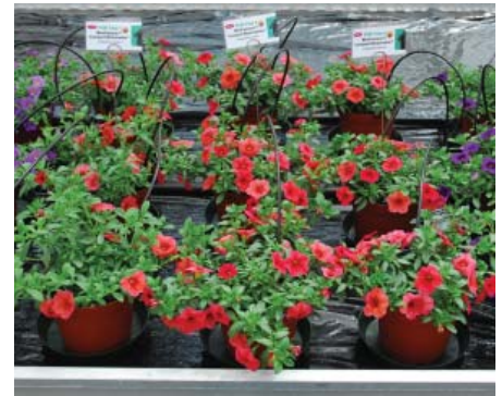
MiniFamous™ Compact Watermelon has a medium vigor.